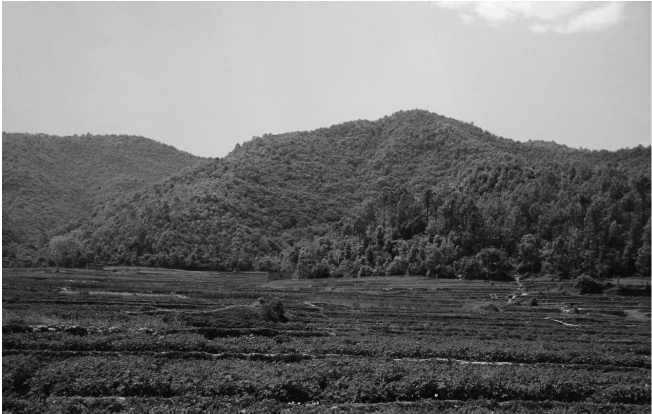
FIGURE 3 Land use and conversion to high forest in Roshi Watershed at 1500 m. The 3 main pathways of high forest regeneration are visible on this hillside. On the right toeslope is a successful P. roxburghii plantation, with a minor component of broadleaf regeneration. On the central slope (rear) is mixed broadleaf successional forest arising on formerly degraded land. On the left toeslope is mixed broadleaf forest that regenerated within a P. roxburghii plantation and is now dominant on that site.

program in Roshi is succeeding at improving forest cover and condition. Field observations made by one of the authors (A.P.G.) during January–February 1999 found that local residents were skilled at explaining how degraded forests converted to high forests within a few years of protection. At some locations, residents noted a recent increase in livestock loss because of leopard predation. This change was attributed to improved leopard habitat (ie, forest recovery). Other communities in Roshi noted a recent increase in the availability of some of the forest products, including fuelwood (Gautam 1999). In the same study, local key informants expressed improvements in the “overall environmental condition” during the last 10 years, despite a decrease in agricultural productivity (Gautam 1999). The improvement in overall environmental condition was attributed to improvements in forest condition. The perceptions of local forest users provide another avenue of support for the positive biological impacts of implementing Nepal’s community forestry program.